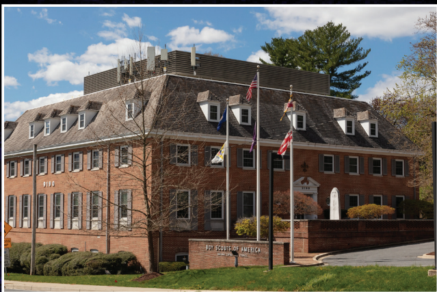
9190 ROCKVILLE PIKE High Profile Bethesda Office Building Investor / User Opportunity