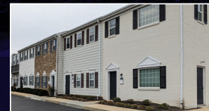
622 HUNGERFORD DRIVE $8,222,400 Office redevelopment property approved for 48 stacked townhomes