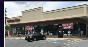
832 ROCKVILLE PIKE $3,850,000 6,000 SF retail building on 0.4 acres