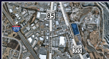
5703 URBANA PIKE Surface Parked Multifamily Development Opportunity