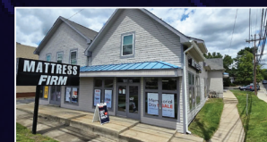
101 N FREDERICK AVE $1,200,000 7,865 SF retail building with 2 upstairs apartments